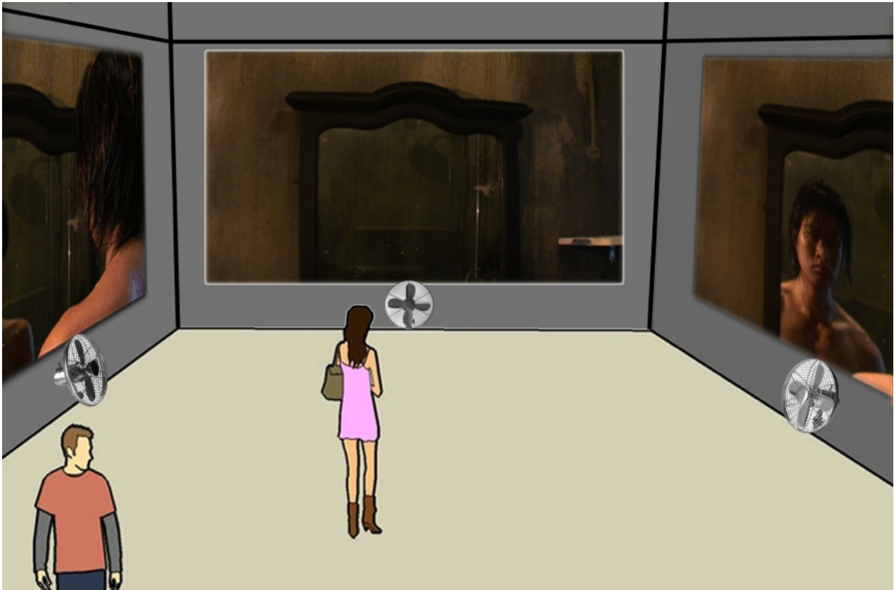
View of the 3 video projection with ventilators