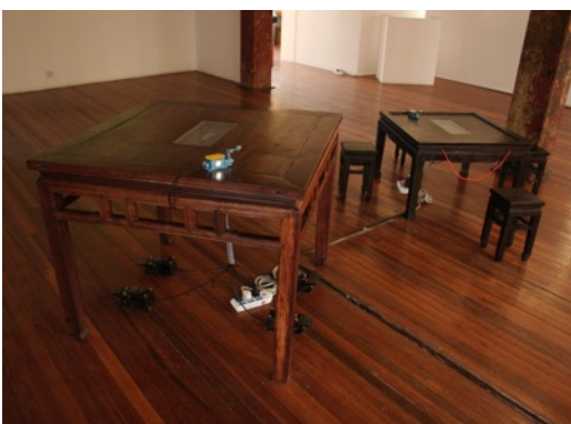
2 Interactive Pong game table exhibited at island6 (Shanghai)