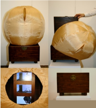
3 Chinese box sold to collector (Charlot Galery - Paris, Jozsa Gallery - Brussels, Braverman Gallery - Israël)