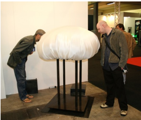
Interactive vidéo sculpture for ARTBrussels, with Jozsa Gallery